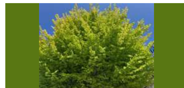
Photo competition: 'I love this tree because...' cpresussex.org.uk